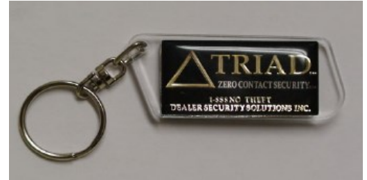
Triad Computerized Key Chain "FOB"

Unlike conventional alarms with external transmitters, Triad is a "Close Proximity Device". Its "RF" (radio frequency) signal transmits only 4"-6" inches making it impossible for thieves using even sophisticated "Code Grabbers" to duplicate.